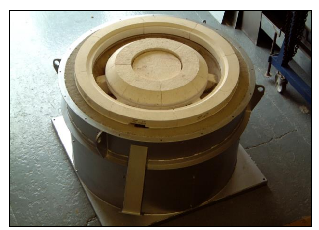
Replaceable Combustion Chamber Module

As there are no moving parts within the Reactor, servicing and maintenance are simple.