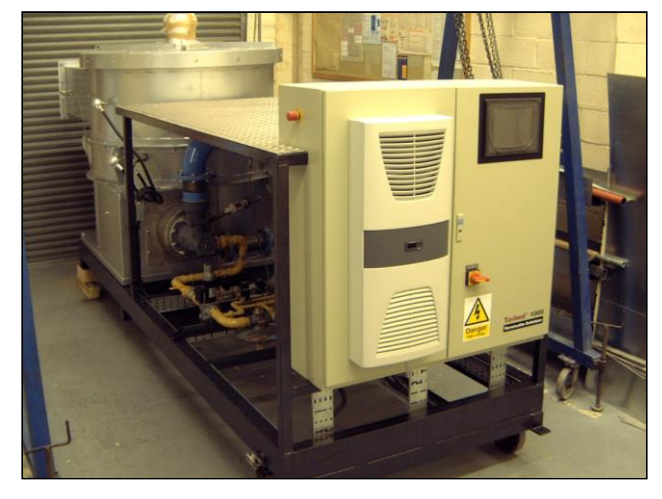
TORBED 1000 Assembled Module

The on-board PLC computer is interfaced by an interactive "touch screen" control panel designed for ease of operation providing the operator with variable and independent control of all operating systems.